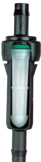
In-Line Filter screen detail