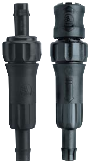
In-Line Filter Snap-On Filter

For low pressure (up to 45 psi) micro irrigation systems.